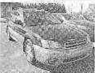
02 SUBARU OUTBACK L.L. Bean 122k miles - Call it now! $3,900! Peter's Auto 402 S. Oak St. - Seneca 883-1467