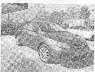
12 TOYOTA COROLLA 70k miles - $12,900 Peter's Auto 402 S. Oak St. - Seneca 883-1467