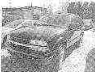
02 CHEVROLET BLAZER 143k miles - $3,500 Peter's Auto 402 S. Oak St. - Seneca 883-1467