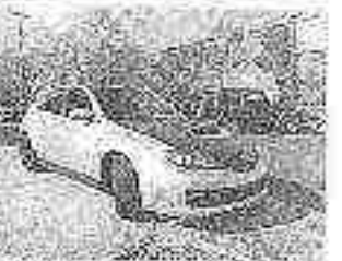
08 SUBARU IMPREZA WRX STI 5 DR. 64k miles - $21,000 Peter's Auto 402 S. Oak St. - Seneca 883-1467