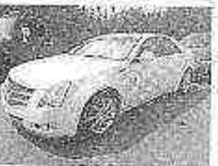
08 CADILLAC CTS 76k miles - $-8,900 Peter's Auto 402 S. Oak St. - Seneca 883-1467