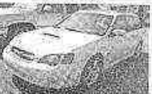
05 SUBARU LEGACY AWD 166k miles $7900 Peter's Auto 402 S. Oak St. - Seneca 883-1467