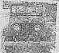
1960 WILLYS JEEP 4x4, 4 cyl. low mileage, 10 ply tires, 1 axle Buick V-6 motor, $4500. 864-382-0088, leave message.