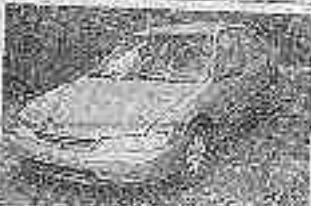
1995 HONDA ACCORD 4DR. SPED. AG. 214,000mi New scratch bumper, fuel filter & spark plugs. Good condition. $1,300. Call 828-509-7054.