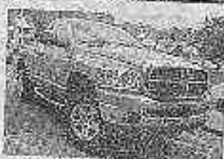
05 DODGE SLD W/AD HEV! 8,200 miles $18,200 Pete's Auto 864-382-1467 402 S. Oak St. Seneca