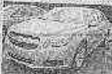
13 CHEVROX ET MAL SU, 800 miles Transferable extended warranty $21,000 Pete's Auto 864-382-1467 402 S. Oak St. Seneca