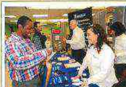
More than 1,900 job seekers were served through 79 hiring events in 2016.

WorkLink Workforce Development Board (WDB) develops the link between employers and employees in Anderson, Oconee and Pickens Counties. The volunteer board of directors ensures that the local workforce development system is market-driven and responsible in meeting the employment and training needs of businesses and job seekers. The board implements the Workforce Innovation and Opportunity Act of 2014 in partnership with local service providers and through a comprehensive SC Works system that provides access points for employment and training services.