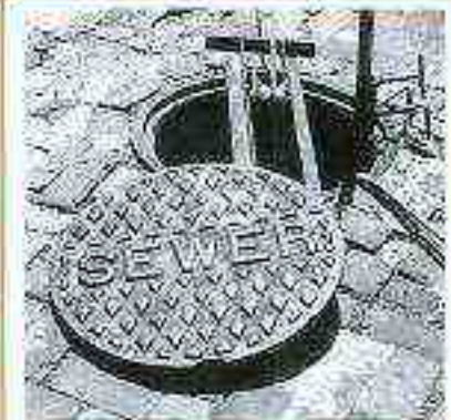
ACOG Grant Services routinely assists communities with grants related to infrastructure repair and improvement.

The Grant Services Department is funded by federal and local dollars. Most of the department's revenue is associated with grants administration fees.