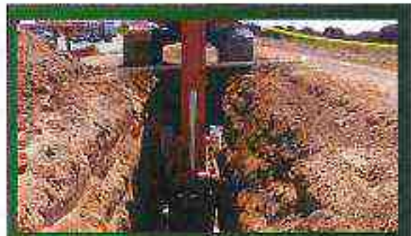
ACOG worked on the administration of an ARC grant to construct sewer lines along Highway 5.