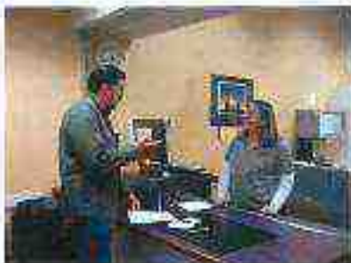
The ACOG Government Services Department provided training in areas such as customer service.

The mission of the Government Services Department is to help the governmental entities in this region in any way possible.