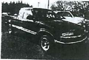
02 CHEVY S-10 179K Miles • $5,900 Pete's Auto 402 Oak St. • Seneca 882-1467