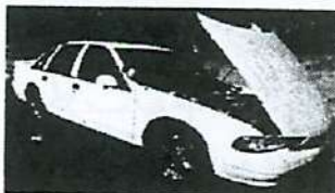
93 CHEVROLET CAPRICE "Customized" 180k miles • $5800 Pete's Auto 402 S. Oak St. • Seneca 882-1467