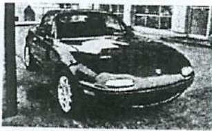
97 MAZDA MIATA Convertible 170K Miles • $4,000 Pete's Auto 402 Oak St. • Seneca 882-1467