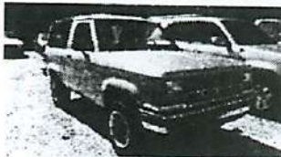
89 FORD BRONCO II XLT 4WD 177k miles • $5500 Pete's Auto 402 S. Oak St. • Seneca 882-1467