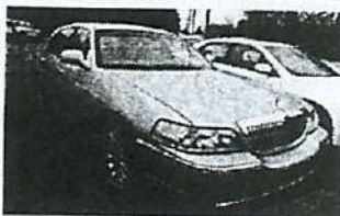
05 LINCOLN • 84K Miles 1 Local Owner • $8,500 Pete's Auto 402 Oak St. • Seneca 882-1467