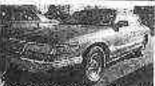
85 MERCURY GRAND Marquis 59,960 miles - $3,900 Pete's Auto 402 S. Oak St. - Seneca 864-902-1457