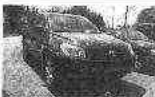
08 TOYOTA RAV4 4WD 3rd row seat 55,000 miles - $14,300 Pete's Auto 402 S. Oak St. - Seneca 852-1457

8000 FORD RANGER XLT: blue, two door, 150K miles, good condition, $3,200, 864-903-9028