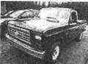
83 FORD F100 $3,500

8000 FORD RANGER XLT: blue, two door, 150K miles, good condition, $3,200, 864-903-9028