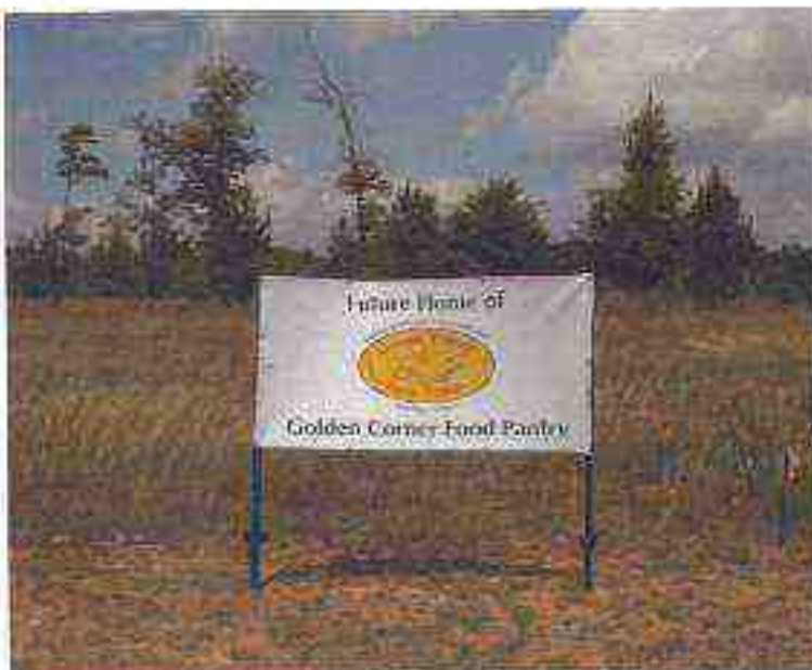
Future Site of Our New Facility

The capital campaign needs to raise a total of $450,000 to cover the cost of the land, building, site work, and the necessary equipment. The capital campaign funds for the new facility are separate from the annual operating budget.